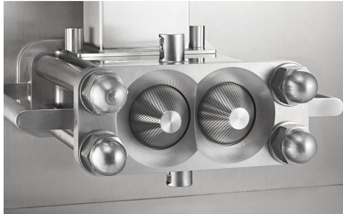
Extruder screw system detail showing the triple compression system for the axial die configuration

Improved extrusion technology with the caleva cone system (compared to dome systems). Consistent dies holes and pressing cam to screen distances. Minimal flexing during operation. Triple compression extrusion using Caleva cone dies.